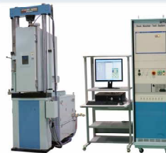
ASH type Shock Absorber Test System