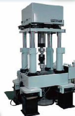
KCH type Elastmer Test System