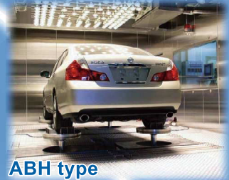
ABH type 4Poster Driving Simulator