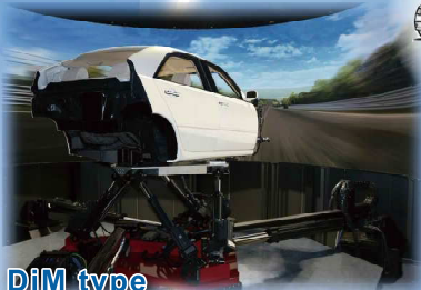
DiM type New Driving Simulator